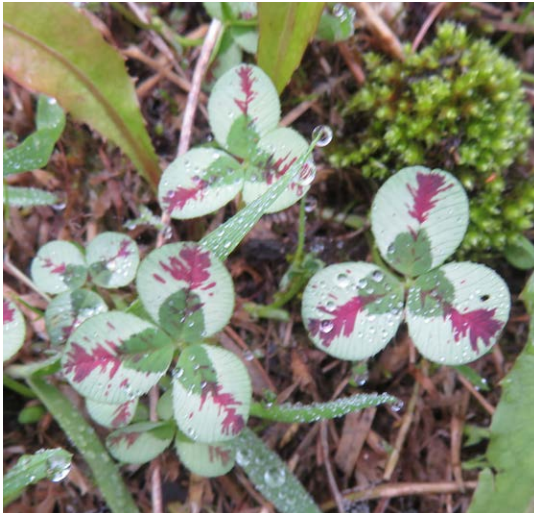
A patch of the striking Trifolium repens cultivar 'Dragon's Blood' was naturalised along the back lane of Milton Terrace in Brithdir.