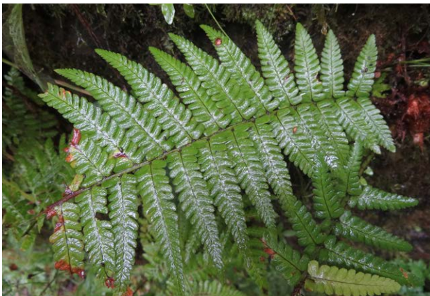
An unusually compact specimen of Dryopteris affinis (Scaly Male Fern) on the roadside retaining wall was not convincing for either subsp. affinis or subsp. borreri , and further expert determination was rendered difficult by the absence of any sori.