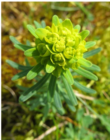
Euphorbia cyparissias was a surprise find, and it turned out to be the first hectad record since 1941!

After lunch, we moved slightly eastward, encountering a plant unfamiliar to nearly all of us, which at length we agreed was the introduced species Euphorbia cyparissias (Cypress Spurge). Lamium amplexicaule (Henbit Dead-nettle) and Picris hieracioides (Hawkweed Oxtongue) were also present in this area, with the latter occasioning lengthy discussion!