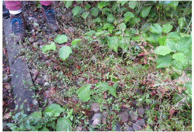
Epilobium lanceolatum – a plant that is... ahem... very easily overlooked!

Happily, some respite was provided by a short walk along a street that allowed us to get up onto the hillside, and here we spent a good 45 minutes or so examining the diverse flora of a grazed field. This site had drier ground with Danthonia decumbens (Heath Grass), Rumex acetosella (Sheep's Sorrel) and Galium saxatile (Heath Bedstraw), but of most interest were some damp flushes. These held a small selection of typical sedges and rushes, along with Anagallis tenella (Bog Pimpernel), Scutellaria minor (Lesser Skullcap), Isolepis setacea (Bristle Club-rush), Veronica scutellata