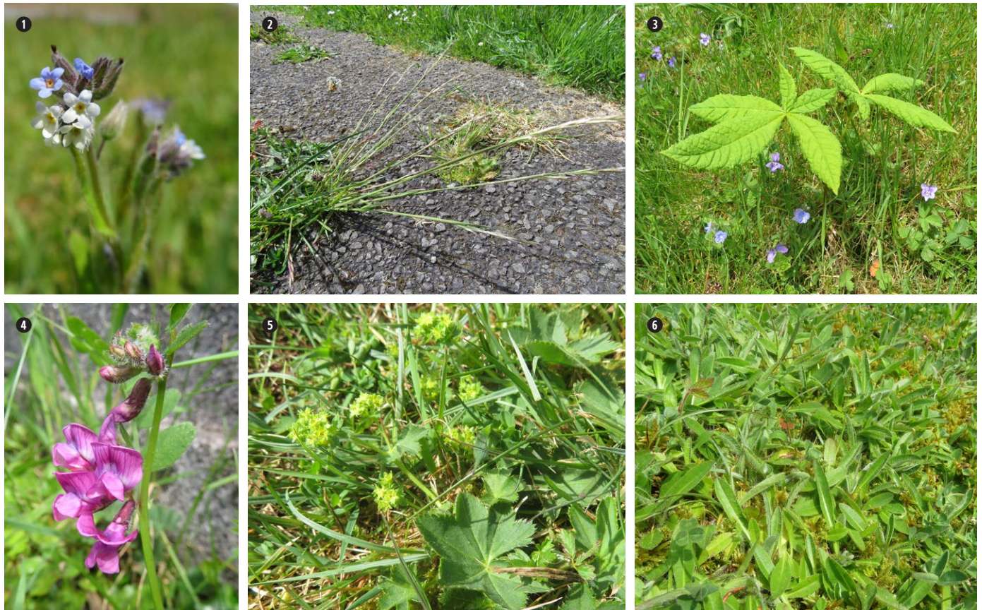
Other points of interest in Trealaw Cemetery included Myosotis discolor subsp. dubia (Changing Forget-me-not) ❶, Avenula pubescens (Downy Oat-grass) ❷, a seedling Aesculus carnea (Red Horse-chestnut) ❸ from a nearby planted tree, a pink-flowered Vicia sepium (Bush Vetch) ❹, Alchemilla filicaulis subsp. vestita (Hairy Lady's-mantle) ❺, and mixed vegetative Pilosella officinarum (Mouse-ear Hawkweed) and P. aurantiaca (Fox-and-cubs) ❻.

Whilst by no means rare, a particularly floriferous and beautiful stand of Veronica chamaedrys (Germander Speedwell) caught our attention as we began to make our way back to the train station. This was followed by an attractive and photogenic stand of V. serpyllifolia (Thyme-leaved Speedwell).