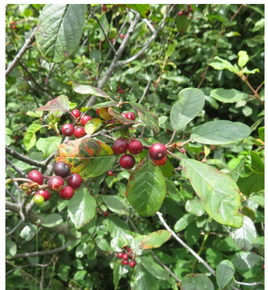
There were a few specimens of fruiting Frangula alnus E of the ford.