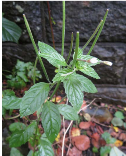
The heavily indented veins, stalked leaves and pale flowers indicate this is Epilobium roseum .