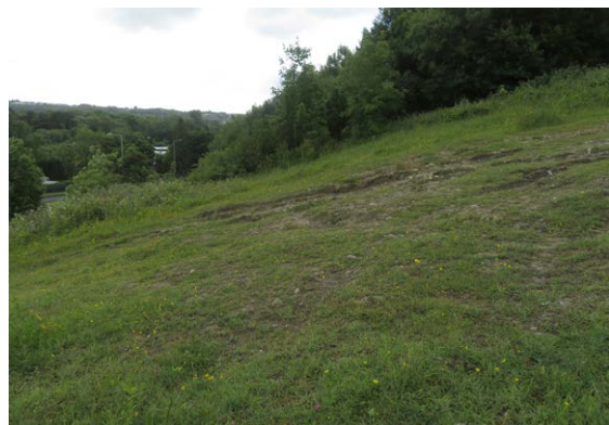
The rough ground by the A4063 (above) where we found two small plants of Neottia ovata (centre) and where regular Vicia cracca (right) rather needlessly caused us confusion!

We then crossed over the A4063 to a rather scrappy and rutted piece of ground, but one that held plenty of botanical interest, with 78 species noted. These included Trifolium medium (Zigzag Clover), Ophrys apifera (Bee Orchid), Neottia ovata (Twayblade), Equisetum telmateia (Great Horsetail) and several Carex (Sedge) species. We also saw what we thought was more Vicia villosa , albeit just with uniformly purple flowers, but some in the group were less convinced about the difference from regular V. cracca (Tufted Vetch), and following the meeting we realised that we had been too willing to jump to conclusions, and that only Tim's original specimen was true V. villosa .