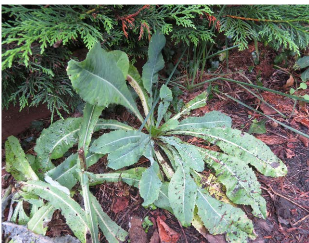
Lactuca virosa (Great Lettuce), found near our lunch stop, is thinly scattered in the S part of v.c. 35 and the Cardiff area in v.c. 41, but absent elsewhere – this is a new hectad record.

Turning under the railway bridge towards the river, we found colonies of two species that were new hectad records for the v.c. 41 side (but not for the v.c. 35 side) – Epilobium roseum (Pale Willowherb) and Poa nemoralis (Wood Meadow Grass). The latter was growing along a damp, shaded retaining wall next to the road, where there was also a good selection of ferns.