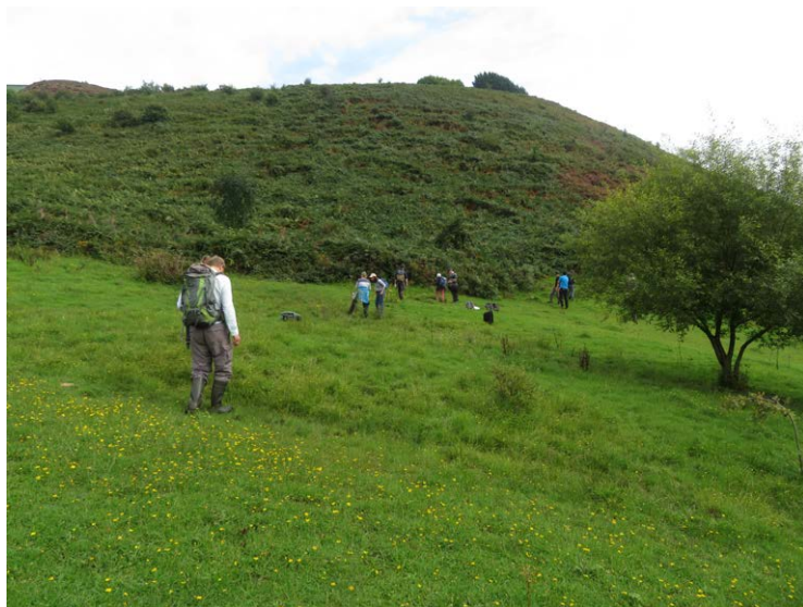
The grazed field at the end of Jubilee Road, Elliot's Town, which provided pleasant botanising in the afternoon.

Not long after, plants which some in the group thought were good for Agrostis curtisii (Bristle Bent) were viewed a little more doubtfully by others, and at length it was concluded that they were in fact Festuca rubra (Red Fescue). Add to that a road layout bafflingly not shown on the OS map, another dead-end up a track necessitating a route revision, and the complete failure by the author of this account (who alleges to be keen on Epilobium ) to observe a substantial colony of a plant that this time was actually E. lanceolatum (Spear-leaved Willowherb)... and it was clear that some of us needed a little more than a lunch break to revive our frazzled brains!