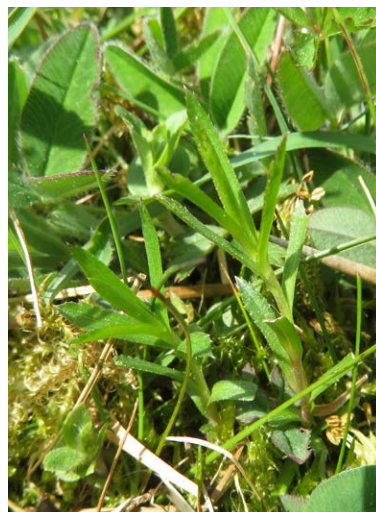
(Top) Jeanette, Faith and David investigating the plants of the short, flushed grassland in the cemetery, which included a large swathe of Carex panicea (Carnation Sedge, bottom left) and young shoots of Achillea ptarmica (Sneezewort, bottom right), here accompanied by the leaves of Trifolium medium (Zigzag Clover).