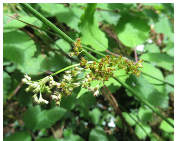
By our lunch stop, sitting on a fallen tree in a sunny glade, we saw a convincing example of Juncus conglomeratus × effusus = J. × kernreichgeltii (a hybrid rush), which has scattered records in the W half of Glamorgan, but fewer in the E, where it may be overlooked.