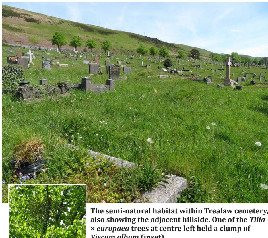
The semi-natural habitat within Trealaw cemetery, also showing the adjacent hillside. One of the Tilia x europaea trees at centre left held a clump of Viscum album (inset).

Trealaw Cemetery held much more interest. Also known as 'Llethyrddu', it was established in 1881 and to this day continues to support a large area of semi-natural habitat, which occurs both between the graves and as large as-yet undisturbed areas of grassland, where we found some areas of flushed damp vegetation. The cemetery also backs on to the hillside of Mynydd Troed-y-rhiw, and looks across to Mynydd y Cymmer and Mynydd Dinas on the southern side of the valley – the source of the Cuckoo calls that accompanied us intermittently during the day.