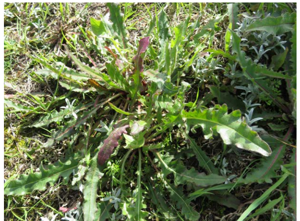
A young rosette of Picris hieracioides proved a tough challenge, but the Vegetative Key once again proved a life-saver, by drawing attention to its distinctive forked, hooked hairs.

At that point, we headed into the small area of dunes, but added little interesting to our list there, except Euphorbia paralias (Sea Spurge). We therefore ambled down to Rhych Point, where we eventually convinced ourselves of the identities of Raphanus raphanistrum subsp. maritimus (Sea