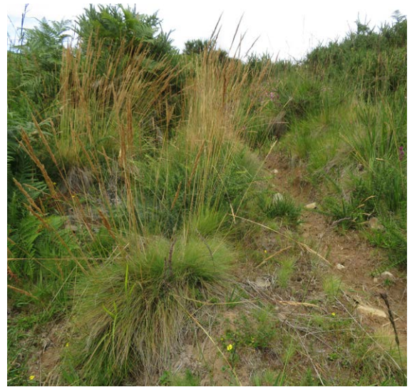
The very narrow, greyish leaves and erect, clustered flowering spikes of Agrostis curtisii were scattered on the N side of the ford.

In one spot we found Carex demissa × hostiana = C. × fulva (a hybrid sedge) with the first but not the second of its parents, and there were two places with a small quantity of Vaccinium oxycoccos (Wild Cranberry), not previously recorded for this site. But the main task for the day was to relocate and map the known population of Rhynchospora alba (White Beak Sedge), at one of only five sites recently seen in Glamorgan. This proved to be fairly plentiful in two main areas of the valley bottom, separated by about 60 m, on or near hummocks amongst peaty, boggy pools, one of which was 'quaking'. Unfortunately, Karen had made the decision to head back only a few minutes before we discovered it! However, she and the rest of the group had already seen the good population of another target species, Eleogiton fluitans (Floating Club-rush), which we later found in smaller quantity in two other places further downstream.