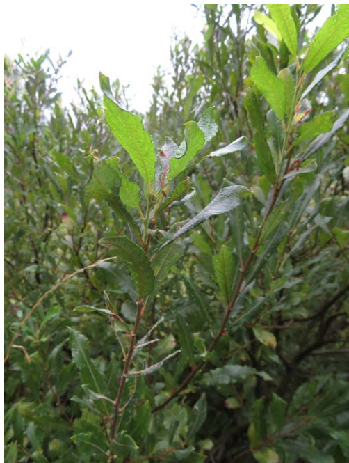
The hybrid Salix cinerea × viminalis = S. × holosericea (Silky-leaved Osier), growing close to the River Rhymney, on the v.c. 41 side.