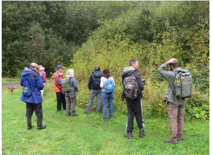
The group scratches their collective heads at the colony of very tall Pastinaca sativa – a species which seems to be increasing on road verges in south Wales.

On this joint excursion with Monmouthshire Botany Group, the approximately 18 assembled botanists gave brief introductions to each other, before starting on the task of cataloguing some less well-recorded habitat either side of the Rhymney. The weather was damp and misty following heavy rain the previous day, and this, along with the large turnout and the tall bracken on the Glamorgan side, dissuaded us from heading up onto the hills as originally planned. We therefore largely kept to the roads and tracks lower down, which as it turned out gave us plenty to look at, with some route re-planning allowing us to divide our time more-or-less equally between the vice-counties.