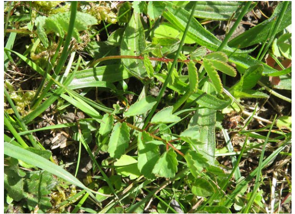
The Sanguisorba officinalis we found was in small quantity, and this early in the season, it took us some time to be convinced of its identity.

An area of short, species-rich vegetation on the lower slopes grabbed our attention. Here, we recorded both Sanguisorba officinalis (Greater Burnet) and Poterium sanguisorba (Salad Burnet) – the latter species together with the Primula veris (Cowslip) possibly suggesting some base-enrichment of the soil (or maybe both were planted by grave tenders?). Other species in this short turf included Luzula campestris (Field Wood-rush), Anthoxanthum odoratum (Sweet Vernal-grass), Lotus corniculatus (Common Bird's-foot Trefoil), and in one location Isolepis setacea (Bristle Club-rush). Between the graves we noted Danthonia decumbens (Heath-grass) and Leontodon hispidus (Rough Hawkbit) – both typically associated with species-rich grasslands.