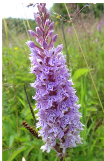
One of the highlights of a relatively diverse, open area within Coed-y-gains was a hybrid swarm featuring plants at all points on the spectrum from (left to right) Dactylorhiza praetermissa (Southern Marsh Orchid) via D. × grandis (Leopard Marsh Orchid) to D. fuchsii (Common Spotted Orchid).