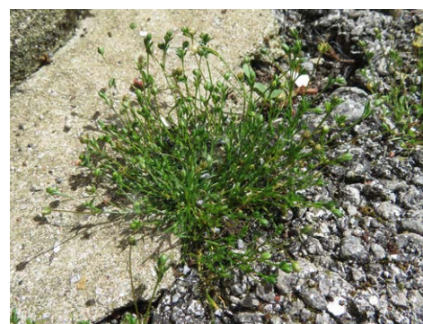
(Left) Tim Rich examining a Hieracium (Hawkweed) on the narrow road on the S side of Alaw Primary School, while everyone else looks on! Elsewhere in these streets, Cerastium glomeratum (Clustered Mouse-ear, centre) and Sagina apetala (Annual Pearlwort, right) were points of discussion.

Trealaw Cemetery held much more interest. Also known as 'Llethyrddu', it was established in 1881 and to this day continues to support a large area of semi-natural habitat, which occurs both between the graves and as large as-yet undisturbed areas of grassland, where we found some areas of flushed damp vegetation. The cemetery also backs on to the hillside of Mynydd Troed-y-rhiw, and looks across to Mynydd y Cymmer and Mynydd Dinas on the southern side of the valley – the source of the Cuckoo calls that accompanied us intermittently during the day.