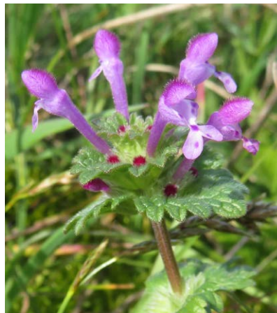
The brilliant magenta flowers of Lamium amplexicaule never fail to disappoint.