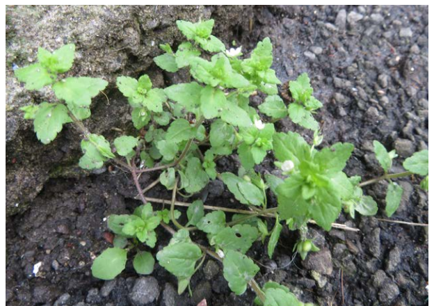
...as does Veronica agrestis (Green Field Speedwell) in New Tredegar later on. The pale flowers provided a hint of its identity, confirmed by the solely patent glandular hairs on the pods.