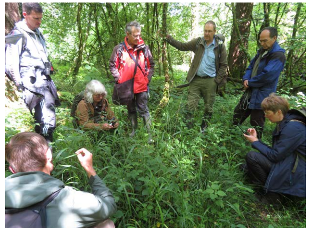
Members of the group examine a patch of Bromopsis ramosa (Hairy Brome), a plant mostly of damp, alkaline soils.

Moving out of the woodland, we passed through a field that had we were told had previously contained a large population of orchids, but which had not been