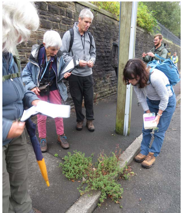
Ononis repens (Common Restharrow) as a street 'weed' in Elliot's Town provides a point of conversation...